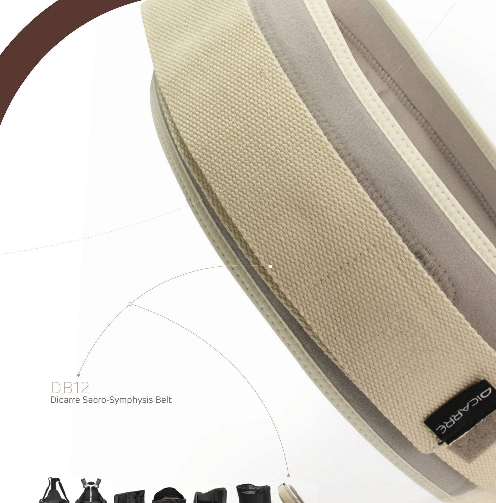
DB12 Dicarre Sacro-Symphysis Belt